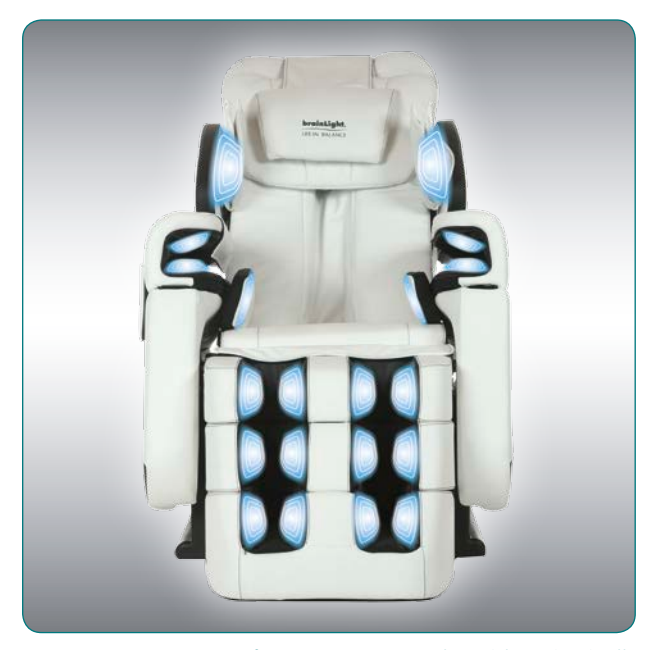
Air pressure massage for various areas, selectable individually or in combination