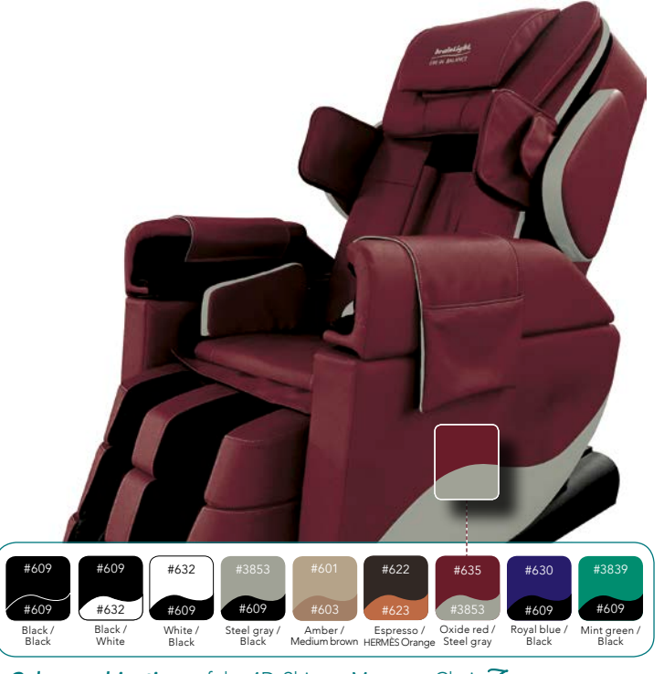
Color combinations of the 4D-Shiatsu Massage Chair Zenesse